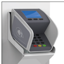
Yomani PIN terminal

The front of the kiosk features a holder for a payment terminal. We integrate your point of sale payment terminal into this, giving you a self-service solution. We build in your payment terminal in accordance with all the applicable regulations, so a secure transaction is guaranteed.