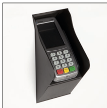
Verifone PIN terminal