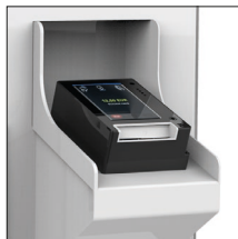
Valina PIN terminal