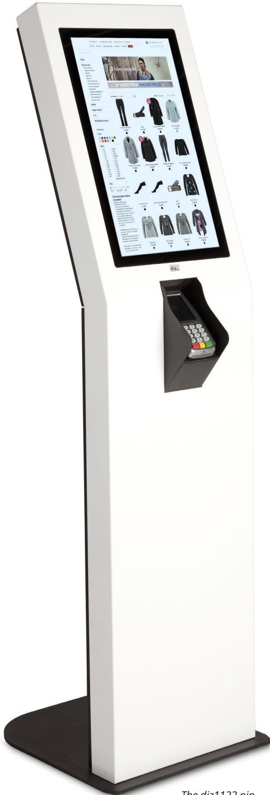
The diz1122 pin